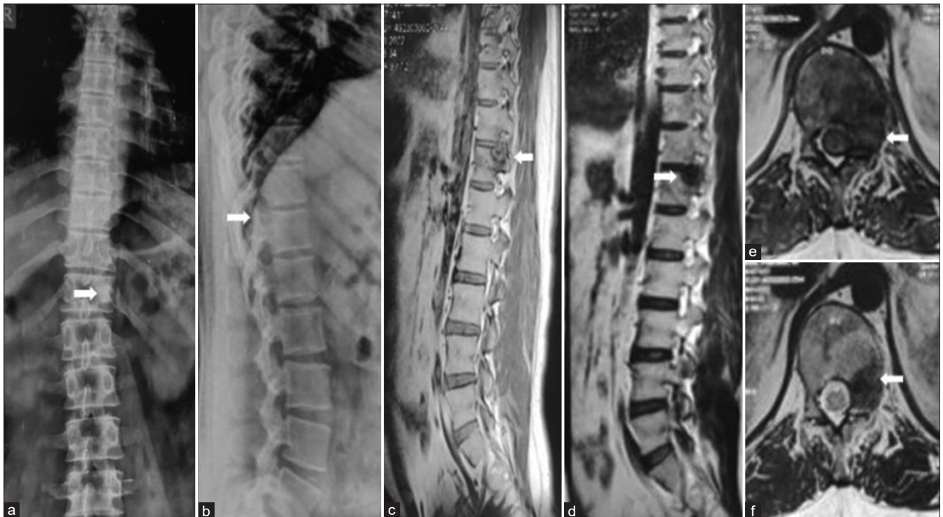
Figure 1: X-ray and MRI images; (a) AP view showing sclerosis of the left D12 pedicle, (b) lateral view showing radiolucent shadow in D12 superior articular process along, (c) sagittal T1WI showing hypointense lesion surrounded by isointense shadow, (d) sagittal T2WI showing hypointense shadow obliterating foramen, and (e) axial T1WI and (f): axial T2WI showing involvement of pedicle and part of endplate (white arrows).